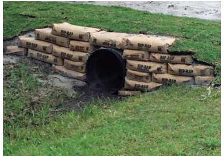
Driveway culvert installation on District roadway

With the large number of installations over the past few months, the District is instituting a temporary suspension of the program from June 1-August 31 in order to complete other District infrastructure maintenance. However, the District will still schedule and replace driveway culverts if there are any urgent or emergency issues with drainage.